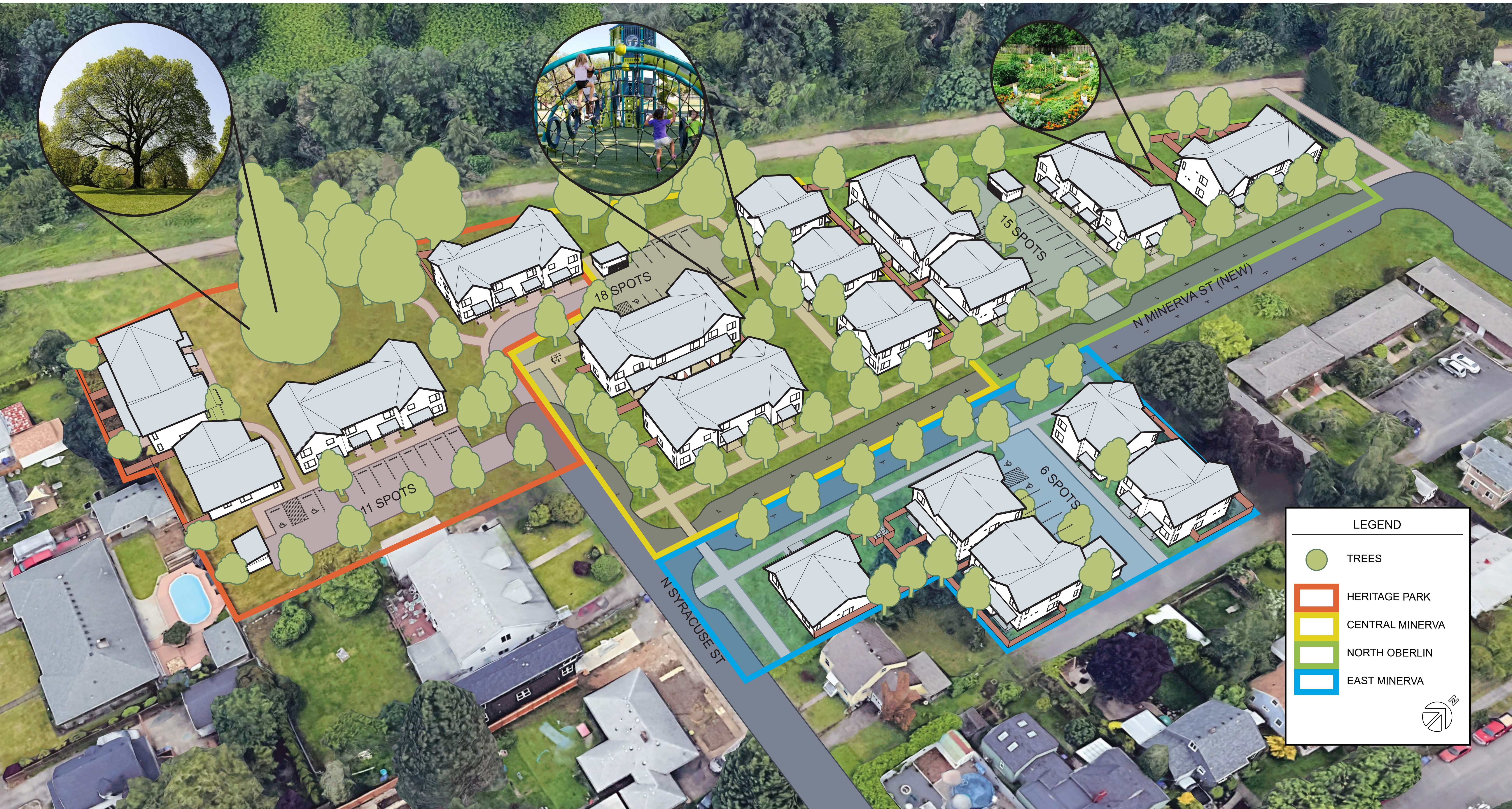
SITE BIRDS EYE VIEW