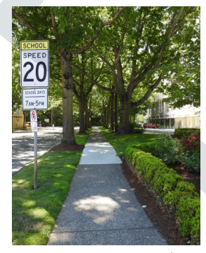
Large, mature trees and vegetation along the public right-of-way on NW Wardway offer links to nature and relief from heat.

At first glance, this transitioning industrial district offers no connection to nature. Yet, a maturing tree canopy in the western Subarea 5, an abundance of scenic views (West Hills, Mt. Hood and the Fremont Bridge), and rich natural history, provide this district with a foundational framework of natural and scenic resources. New development should reference, preserve, and build on this framework and address the community's desire for a more verdant district- one with easy access to its own green spaces, as well as improved and direct connections to nearby Forest Park and the River.