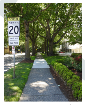
Large, mature trees and vegetation along the public right-of-way on NW Wardway offer links to nature and relief from heat.

At first glance, this transitioning industrial district offers no connection to nature. Yet, a maturing tree canopy in the western Subarea A, an abundance of scenic views (West Hills, Mt. Hood and the Fremont Bridge), and rich natural history, provide this district with a foundational framework of natural and scenic resources. New development should reference, preserve, and build on this framework and address the community's desire for a more verdant district- one with easy access to its own green spaces, as well as improved and direct connections to nearby Forest Park and the River. A few ways to address these goals include: