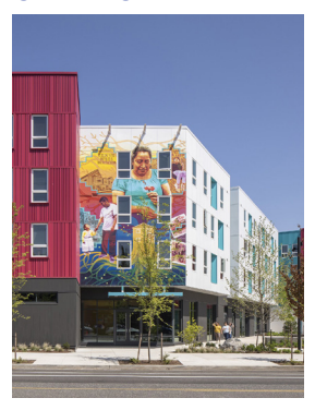
The use of color, art and outdoor gathering spaces provides sense of creative energy and vitality.

Home to a mix of residents, businesses and institutions, this district takes immense pride in its industrial heritage and variety of uses. Physically accessible public spaces, that acknowledge the contributions of Portland's Black, Chinese and Indigenous communities, are needed to support these various communities and reflect the multitude of histories of the area. Future development, should honor the District's rich industrial character and provide spaces which allow for a true mix of uses, reflecting a history of ingenuity and innovation.