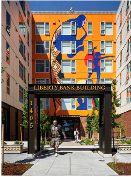
This courtyard entryway creates an inclusive space allowing for colorful artwork and community connection.

WPTC is home to ethnically, racially and economically diverse communities but lacks diverse public spaces to support their needs, including spaces that acknowledge the past and present contributions of the area's Indigenous Communities. Design of the area's architecture and public spaces should be inviting to all. Particularly, spaces within the Multi-Cultural Hub (MCH) 1 and Barbur Transit Center (BTC) 1 should be designed to reflect the community's desire for multi-generational gathering and the fostering of community and cultural connections.