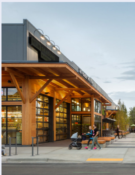
Storefront utilizes a set-back frontage to extend the public realm, providing hardscaped areas, seating and large operable doors.

A "crossroads" of major arterials has created an unwelcoming intersection and pedestrian environment in the Town Center, dividing it into three distinct geographies: central (Barbur and crossroads area), North of and South of Barbur Blvd. Neighborhoods North of Barbur, are defined by a large natural area, views to Mt. Hood, steep topography, and a network of unimproved streets, while the South of Barbur neighborhoods feature a rich network of diverse communities, civic and cultural institutions. Although distinct, each area is transitioning away from auto-oriented development and new development should respond by creating opportunities for a better connected, resilient and people-centered public realm.