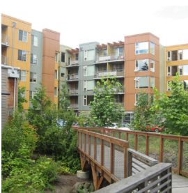
Multnomah Village uncovered and restored Tryon Creek headwaters, supporting natural habitat and functions.

Along with its varied topography, abundant tree canopy and significant woodland remnants, the Town Center has many parks and open spaces; however, connections to these places are often not accessible or intuitive. New development should address the desire of community to, "weave in parks and nature into development" and "integrate buildings with topography", to improve health equity outcomes for it's most vulnerable communities.