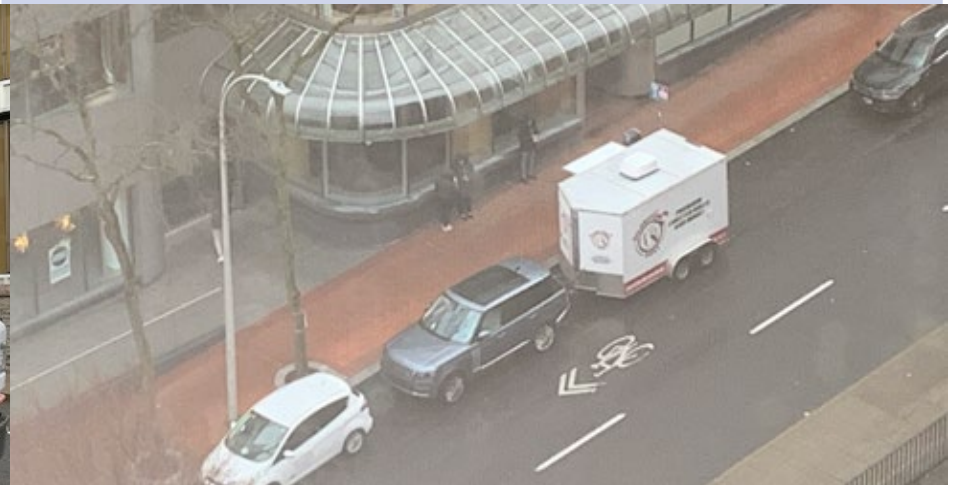
Mobile Food Vending - high percentage towed