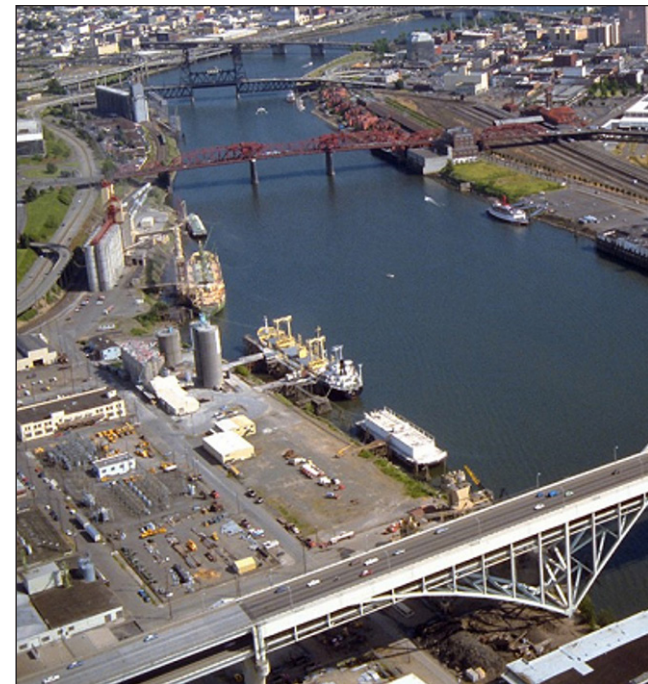
River Mile 11 East

The River Mile 11 East project area lies on the east side of the river, roughly between the Fremont and Broadway bridges. Since 2013, the City has partnered with five other parties to move toward cleanup in this area ahead of the rest of the Harbor. These parties include PacifiCorp, Cargill, Glacier Northwest, CBS Corporation, and DIL Trust, and are called the River Mile 11 East Group. The primary focus of the River Mile 11 East Group this past year has been on two studies that are required to move forward with engineering designs for the cleanup work: 1.) a Recontamination Assessment, and 2.) a Basis of Design Report.