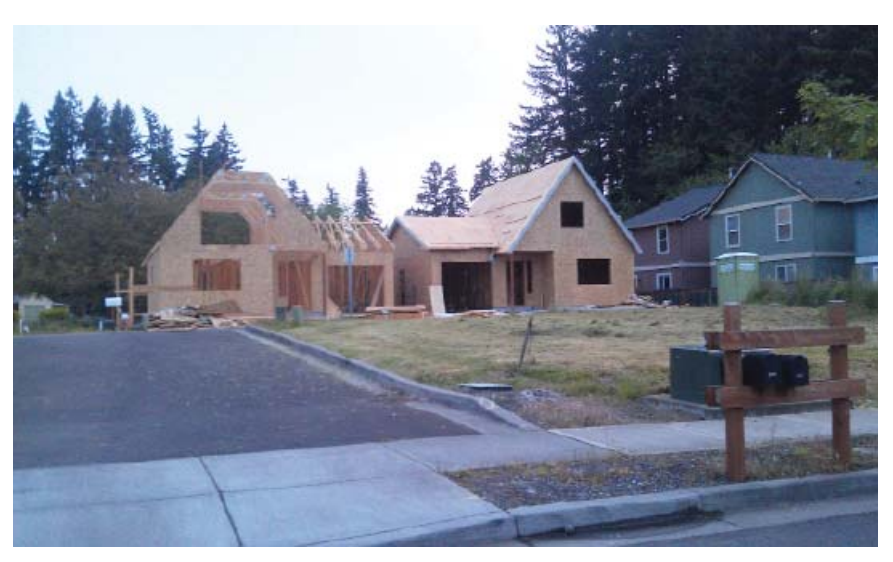
Figure 1 New residential construction

The Bureau of Development Services (BDS) actively works with developers, builders, and homeowners to guide them through the development process. Staff review construction plans, issue permits, and inspect industrial, commercial and residential construction to ensure compliance with construction and land use codes. In FY 2012-13, the bureau issued about 42,000 building and trade permits combined and performed over 134,000 residential and commercial inspections. This work promotes the safety of buildings and livability of Portland's neighborhoods.