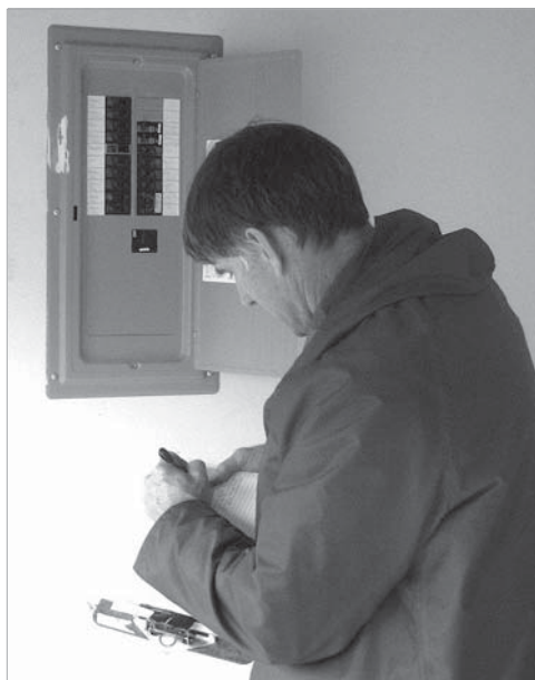
Figure 3 Electrical inspection

The Handbook makes some of its task assumptions and accountability roles for inspectors and managers explicit. It does not, however, directly connect the procedures to Bureau goals, City policies, and state requirements the procedures support. In addition, because the Handbook lacks performance metrics, it is unclear how work is to be evaluated. Discussion and interpretation about Bureau practices and policies occurs in the Inspections units. Managers of both units indicated they do discuss different interpretations at staff meetings, and also through emails.