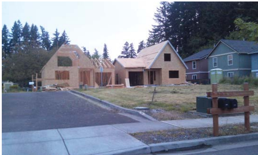
Figure 1 New residential construction

The Bureau's Inspections Services Division inspects industrial, commercial, and residential construction. The Commercial Inspections section performs inspections in all four trade specialties – structural, electrical, plumbing and mechanical – on industrial, commercial, and multi-family construction projects. It also provides some plan review services for commercial plumbing and electrical permits. The Residential Inspections section (also known as Combination Inspections) ensures that new and remodeled one and two family residences meet building safety codes and requirements. The goal is for inspectors to have certification in all four trade specialties. According to BDS, this allows the program to perform more inspections with fewer staff.