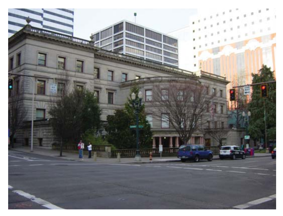
City Hall