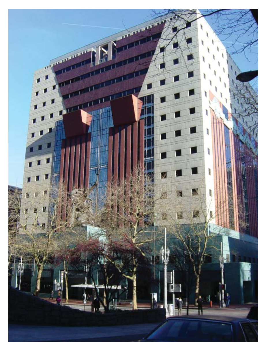
The Portland Building