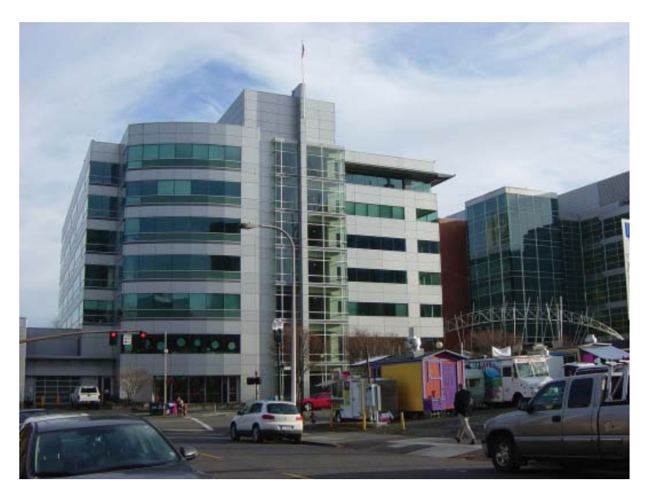
1900 Building

According to Facilities management, there is currently not a systematic look at space needs/projections across the City, but they told us that it would be beneficial to have a centralized function to achieve this. However, they pointed out this is made difficult due in large measure to Portland's unique form of government.