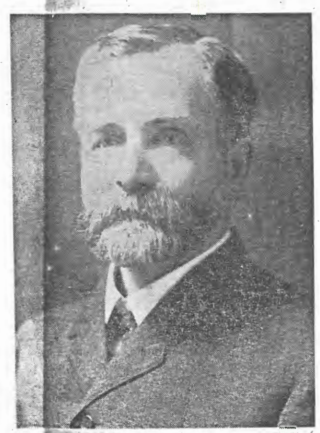
FRANK E. BEACH

Beach died in 1934 at the age of 81 in a traffic accident. According to reports of the day, he alighted from a street car, passed around the rear end and was crosswas highly praised. Fing the street when struck