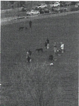
The Fields Park.jpg 941K