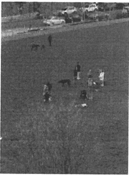
The Fields Park.jpg 941K