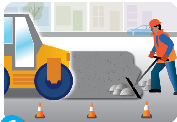
6 Restoring the road surface.