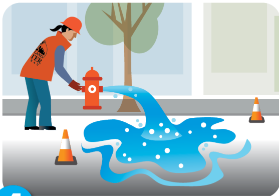
4 Flushing/sanitizing and connecting to the water system.