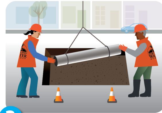
3 Installing or replacing pipe.