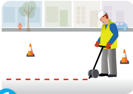
1 Marking the street.