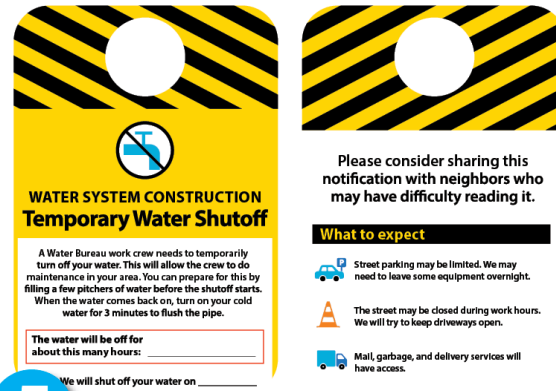
5 Connecting the new pipe to people's water meters. We will put a notice on your door at least 24 hours before a water shutoff.