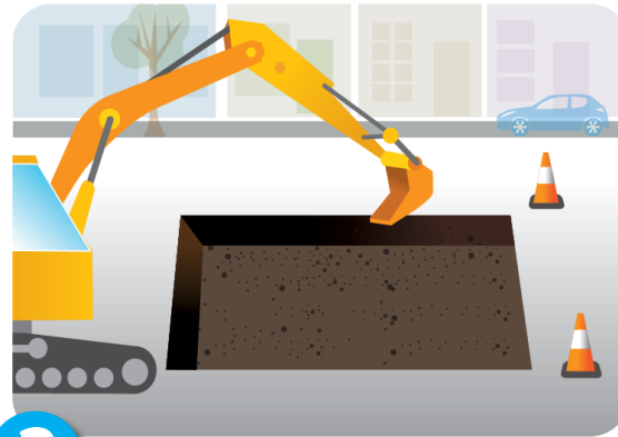
2 Cutting the road and digging a trench.