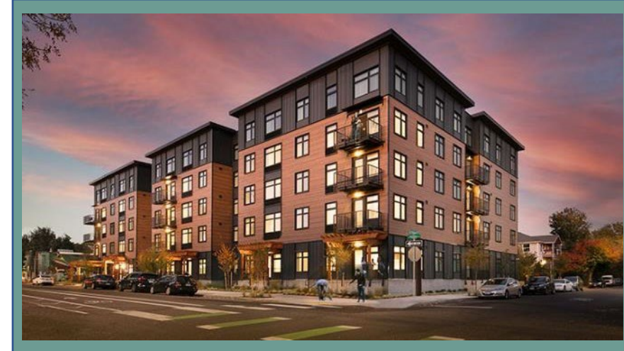
Beatrice Morrow Apartments cleanup of a chemical storage site, now affordable housing developed by Prosper Portland and PCRI