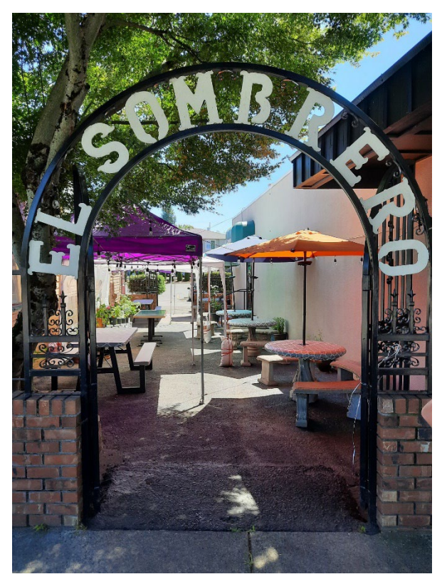
Outdoor seating at El Sombrero