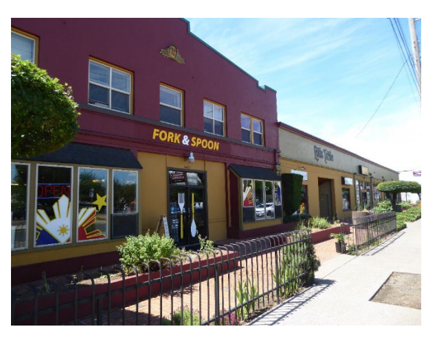
Small businesses along Sandy Boulevard