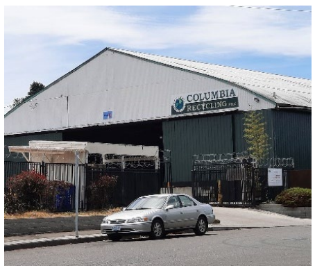
Youth career workshop and examples of Columbia Corridor businesses providing employment in the Parkrose neighborhood