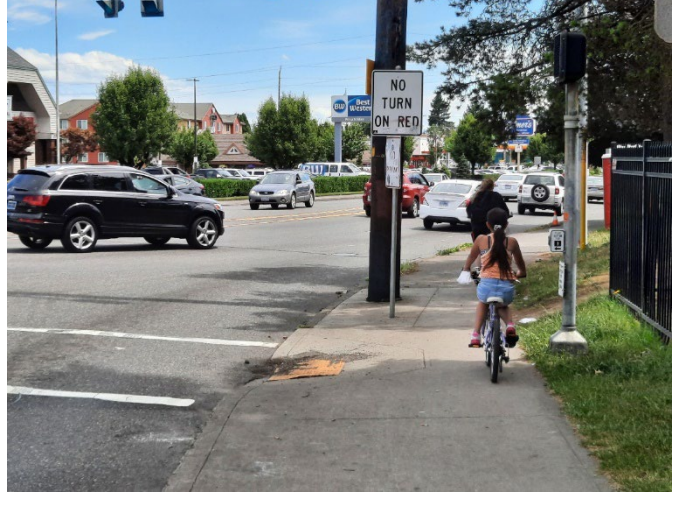
Sandy Boulevard and memorial