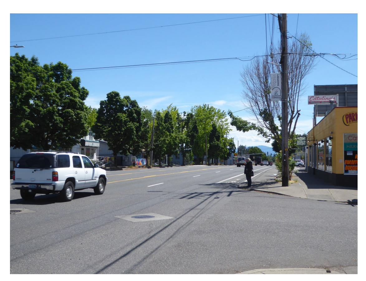
Pedestrian crossing at Sandy Blvd and NE 109th Avenue

Action: Advocate for a future project to focus on improvements to Sandy Boulevard east of NE 122<sup>nd</sup> Avenue to address the lack of pedestrian and transit amenities along a corridor with a lot of multifamily housing.