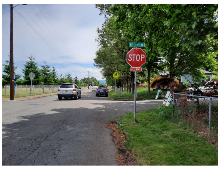
NE Shaver – a key route for students walking to school, and for cars