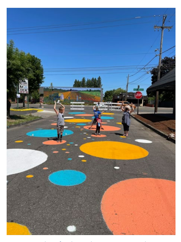
Temporary plaza for the Parkrose Pop-Up Market