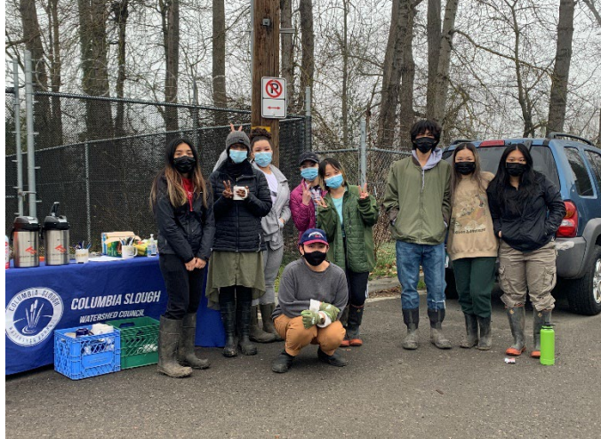
Senn's Dairy Park