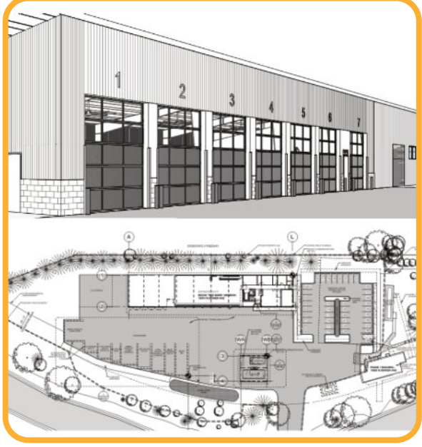
Delta Park Urban Forestry Yard