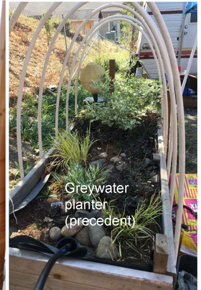
Greywater planter (precedent)