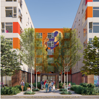
This courtyard entryway creates an inclusive space allowing for colorful artwork and community connection.

West Portland Town Center is home to ethnically, racially and economically diverse communities but does not offer enough diverse public spaces to support them. Design of the area's architecture and public spaces should reflect the community's pride in its multi-cultural and multi-generational identity, particularly within the future Multi-Cultural Hub.