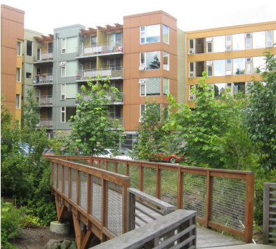
Multnomah Village uncovered and restored Tryon Creek headwaters, while supporting the area's natural habitat and functions.

Along with its varied topography, abundant tree canopy and significant woodland remnants, the Town Center has many parks and open spaces; however, connections to these places are often not accessible nor intuitive. New development should address the desire of community to, "weave in parks and nature into development" and "integrate buildings with topography", to improve health equity outcomes for it's most vulnerable communities.