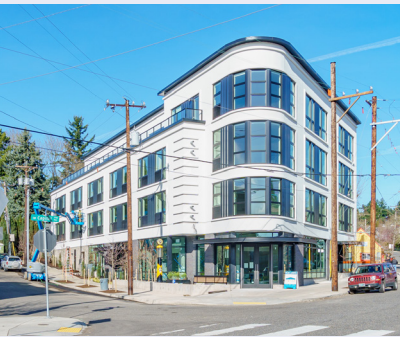
Multnomah Station steps back and up to create a prominent, covered entry with seating, at curved corner site.

An abundance of large roadways, surface parking, narrow sidewalks, inactive facades and little to no protection from the elements, has created a harsh and unwelcoming pedestrian experience within the Town Center. As the area transitions away from auto-oriented development, and addresses issues of health equity, architecture and urban design should respond by creating an inclusive and comfortable public realm for people, particularly on sites within the crossroads area.