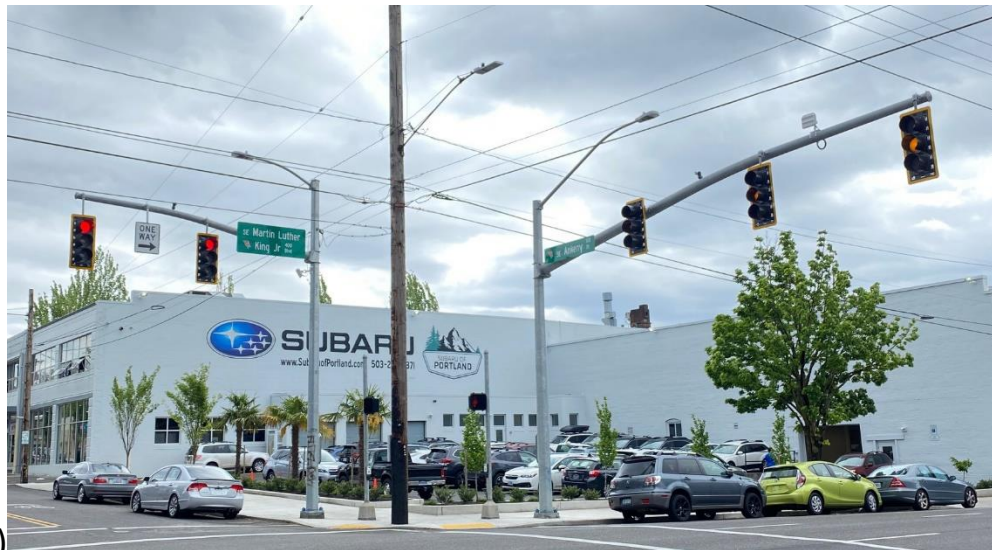
Luther King: )

Yes, this would add the cost of a second pole, with the base foundation and wiring to that new location, and the curb extension. These are costs that should be weighed with other city goals of more housing in High Opportunity locations, rain protection, and more successful buildings. The great majority of new poles being installed today are nearer the curb (like these two poles at SE Ankeny and Martin