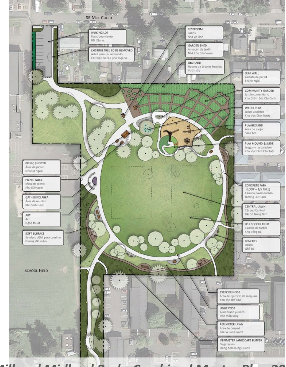
Mill and Midland Parks Combined Master Plan 2017: Mill Park Site Plan