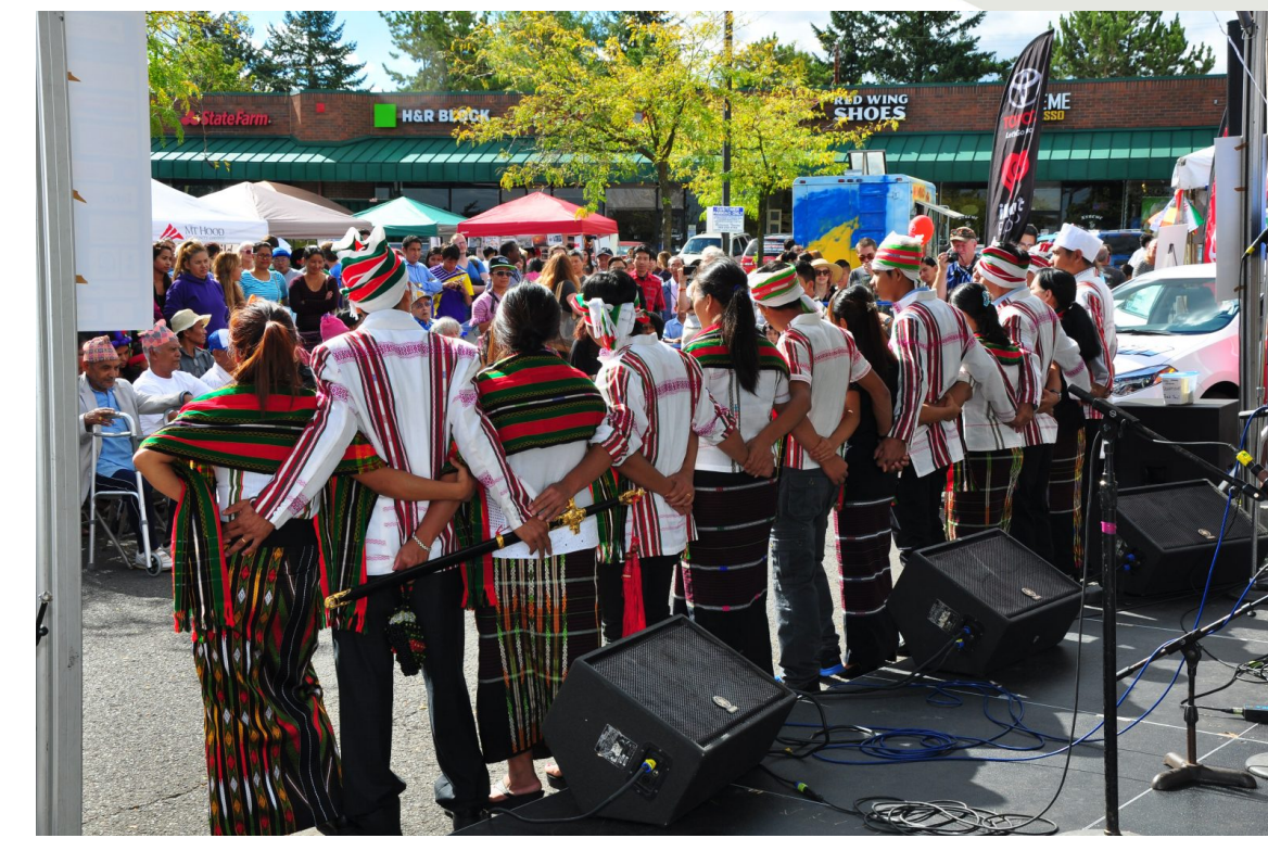
Performers at DMA's Festival of Nations