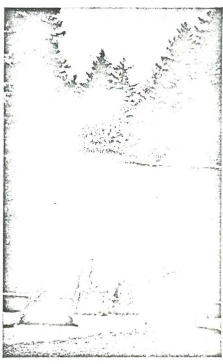
From nearby parking lot you can see layers of gravel, cinders, lava rock that Portland's Mount Tabor volcano spewed forth