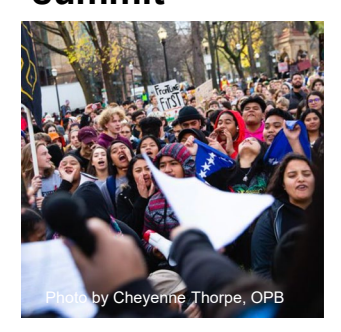
Youth climate summit