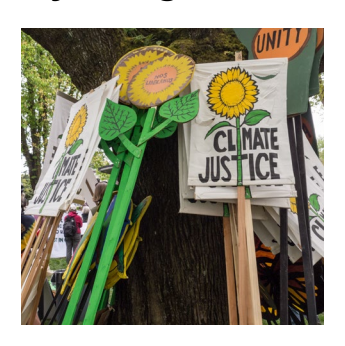
Climate justice by design