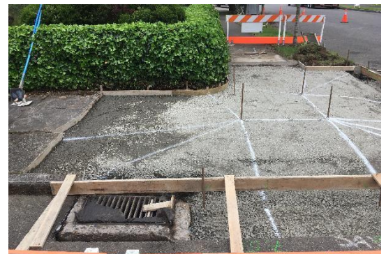
Photos: (Left) Workers at one of the pilot test sites moving wet concrete. (Above) Site preparation work at one of the pilot test sites.