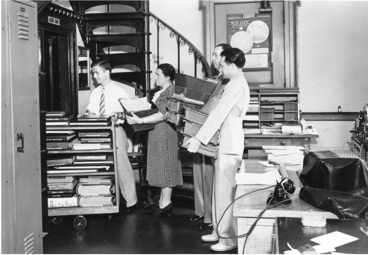
Loading documents into the elevator in the City Auditor's office, 1940