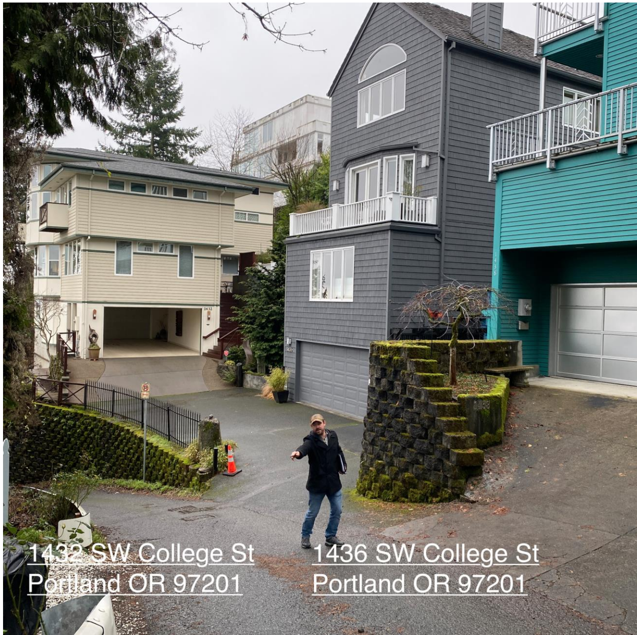
This home is located east from the appellants and our lot. This is shown just to substantiate the typical scale and mass of the homes in the area when viewed from the street.