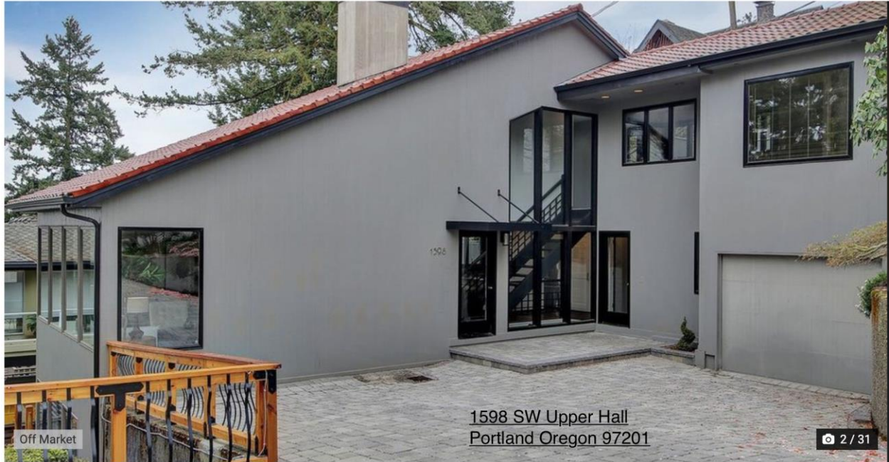
Appellants home. Building height 2-Story. The north wall of this home is massive when standing north and looking south.