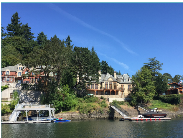
Single-family homes next to the river's edge are common in the South Reach.