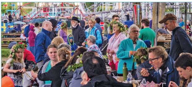
Residents of nearby neighborhoods have easy access to amenities like Oaks Amusement Park.