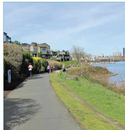
The Willamette Greenway trail was made for runners, walkers, rollers and strollers of all ages and abilities.

“Enhance the role of the Willamette River South Reach as fish and wildlife habitat, a place to recreate, and as an amenity for riverfront neighborhoods and others”