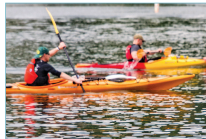
Water-based recreation opportunities abound in the South Reach.