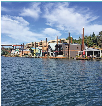
Floating homes and multifamily buildings offer unique housing choices along the South Reach.

The South Reach has a unique mix of parks and natural areas, housing types adjacent to and on the river and commercial uses — all a short distance from Downtown.