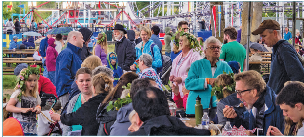
Residents of nearby neighborhoods have easy access to amenities like Oaks Amusement Park.