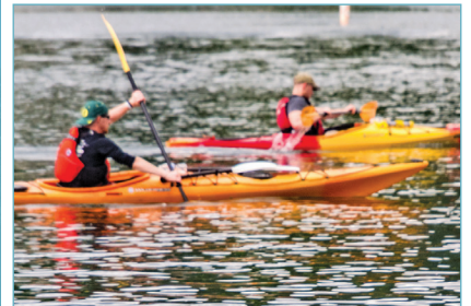
Water-based recreation opportunities abound in the South Reach.