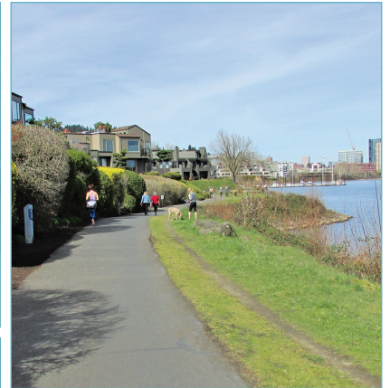
The Willamette Greenway trail was made for runners, walkers, rollers and strollers of all ages and abilities.

“Enhance the role of the Willamette River South Reach as fish and wildlife habitat, a place to recreate, and as an amenity for riverfront neighborhoods and others”