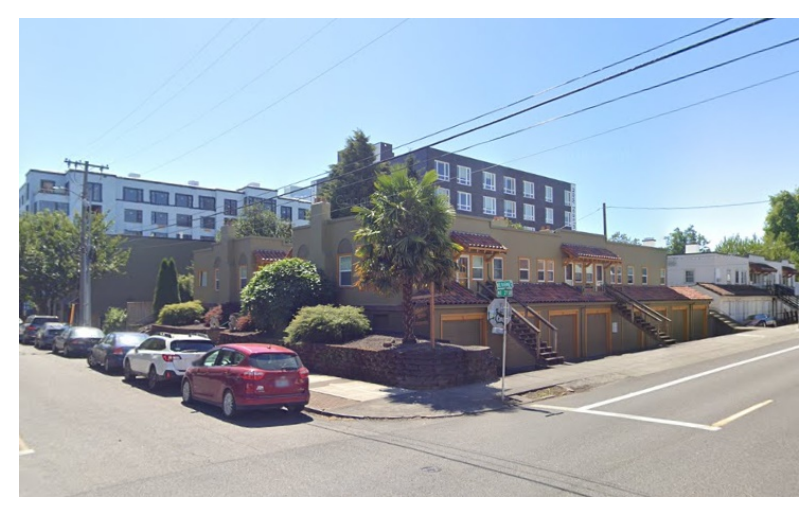
Existing housing and new development