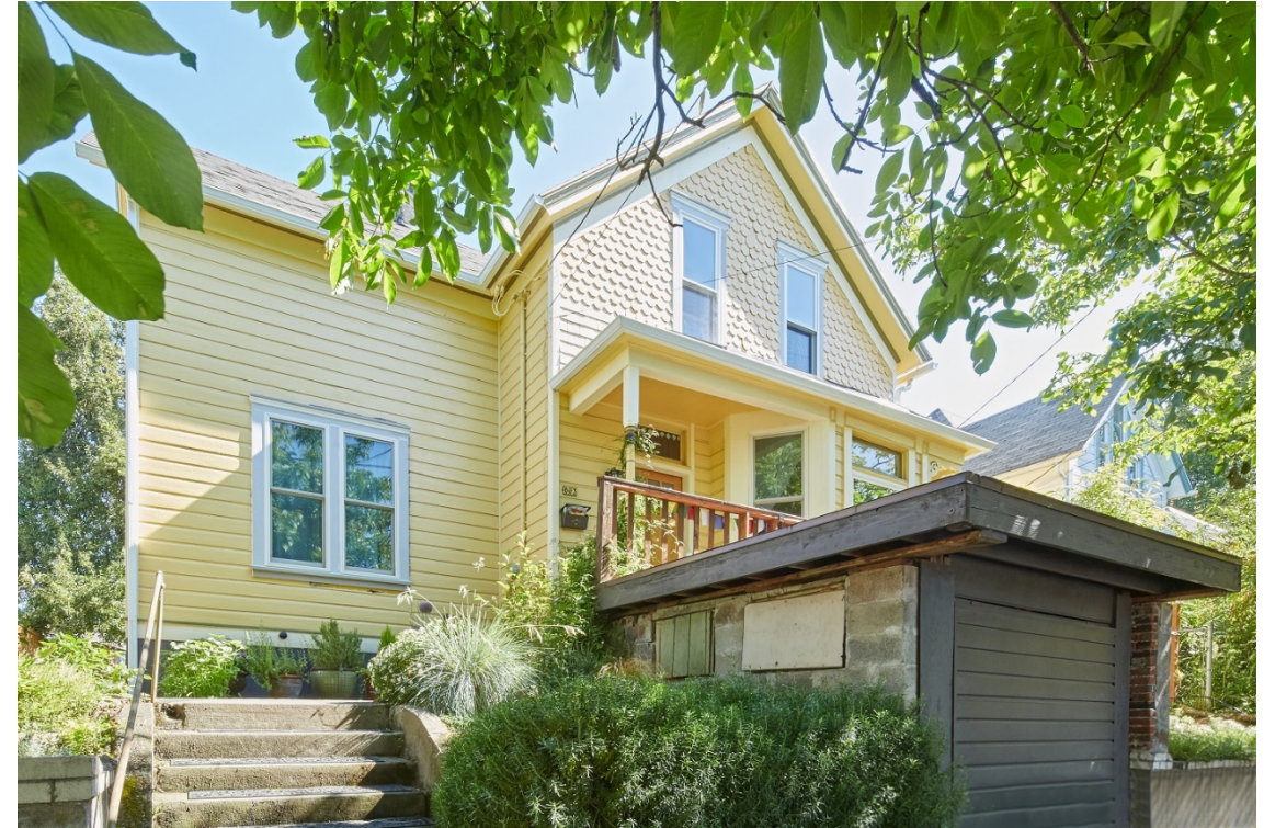
Eliot Conservation District