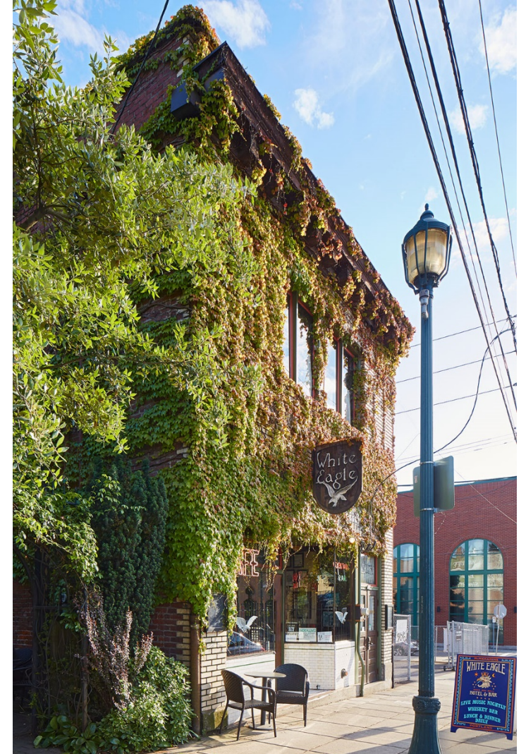
Russell Street Conservation District