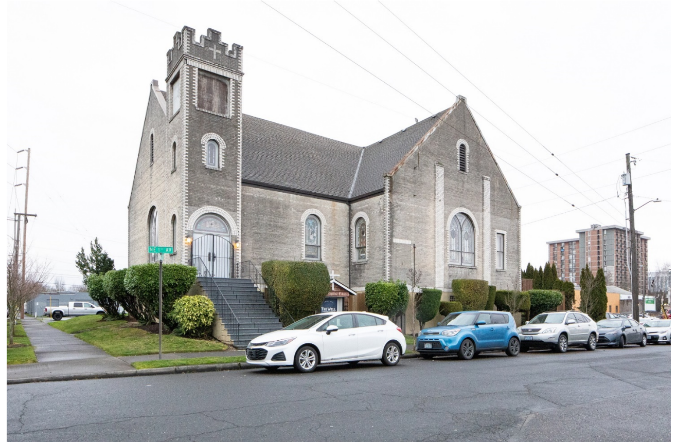
Mt. Olivet Baptist Church.