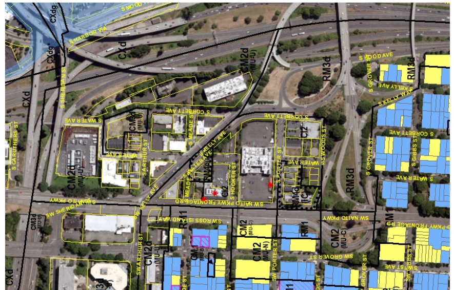
Edge of South Portland Historic District Blue – Contributing resources; Yellow – noncontributing resources