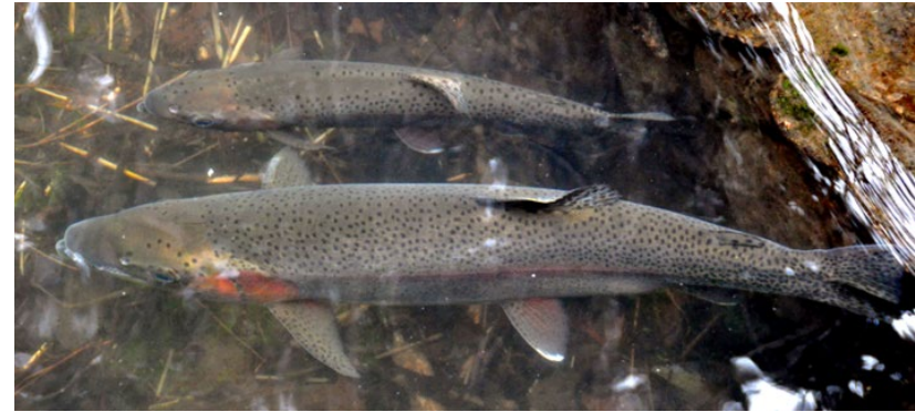
Salmon in Crystal Springs