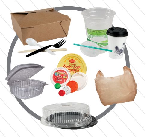
GARBAGE Coffee cups/lids/pods, paper/plastic plates, take-out food containers/wrappers, drink cups/straws, cutlery, frozen food packaging/trays, plastic caps/lids, plastic bags, facial tissue, painted/stained wood, plywood, incandescent light bulbs, garden hoses.