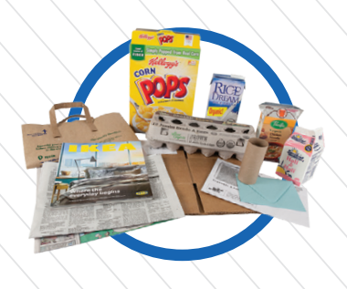
PAPER Newspapers, magazines, catalogs, phone books, flattened cardboard boxes, scrap paper, cartons (milk, juice, soup), shredded paper (in paper bag).