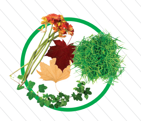
YARD DEBRIS Weeds, leaves, vines, grass, small branches, flowers, house plants, plant clippings.