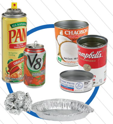
METAL Aluminum, tin and steel food cans, empty dry metal paint cans, empty aerosol cans, aluminum foil, scrap metal (shorter than 30" long and less than 30 lbs).