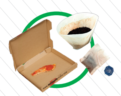
OTHER Paper napkins, paper towels, coffee filters, tea bags, pizza delivery boxes.