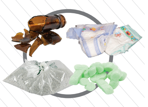
MUST BE BAGGED Pet waste, cat litter, diapers, feminine hygiene products, ashes, sawdust, packaging peanuts, broken glass.