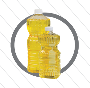
PLACE IN SEALED CONTAINER Kitchen fats, cooking oil, grease.