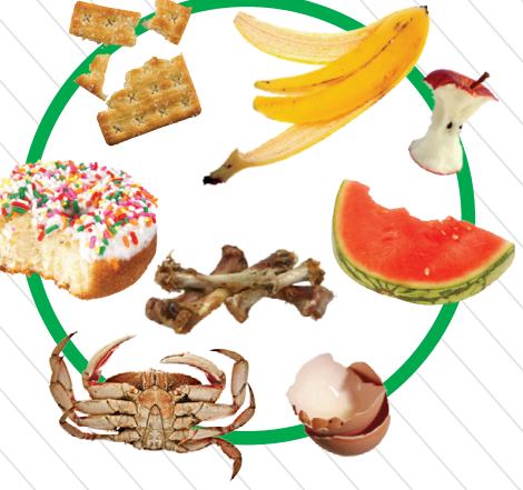
FOOD SCRAPS Meat, poultry, seafood, bones, cheese, eggshells, bread, pasta, grains, beans, nuts, fruits, vegetables, coffee grounds, spoiled food.