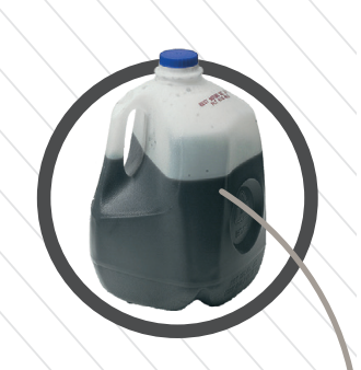
MOTOR OIL Put in a leakproof, clear plastic jug with lid and place next to carts for recycling.