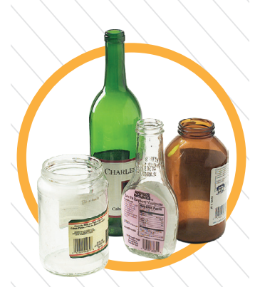
GLASS BOTTLES & JARS Place in yellow bin or other plastic container with a "glass only" sticker.