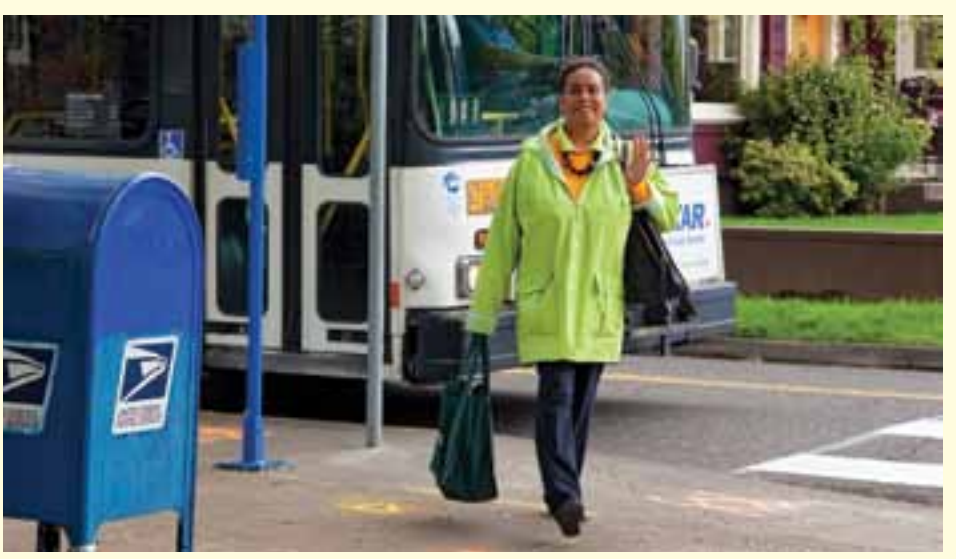
Many Portlanders have already made the switch to reusable bags.