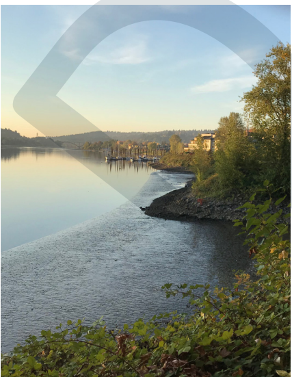
Step back development from greenway to preserve resources and views.

Macadam's location along the Willamette River's South Reach is a key factor in the continued health of local endangered and threatened fish, wildlife and rare plants. This riverine corridor is part of the Pacific Flyway for migrating and nesting birds. Future development along the river and trails should activate the river frontage, while minimizing noise and lighting impacts on the trail and riverfront habitat. Development should include native plantings to enhance wildlife habitat, soften building edges and screen parking areas.