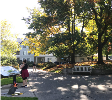
Communal open space along greenway at Heron Point.

The riverfront is significant for the regions' tribal nations, urban native community and others who carry out cultural practices near and on the river, such as launching canoes and fishing. Residents and visitors value the area's nearly two miles of accessible Willamette River shoreline, with an accessible greenway trail, Willamette Park, Heron Point Wetlands and the Cottonwood Bay natural area. Development should recognize the recreational, social and cultural values of the riverfront through onsite features and river-responsive design.