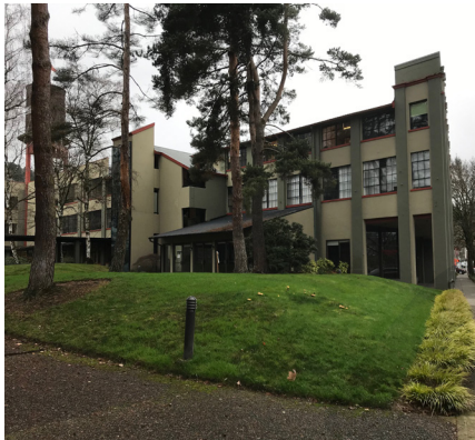
Adaptive reuse of Water Tower building as a commercial business center.

Past City policies envisioned SW Macadam as a tree-lined boulevard with safe routes for both pedestrians and cars. Existing development — a mixture of river-oriented businesses, suburban-style shopping centers, office parks and apartment buildings — does not necessarily support a public realm focused on the comfort and safety of pedestrians over cars. Future site and building design should be responsive to this vision for Macadam Avenue and the context of the Willamette Riverfront.