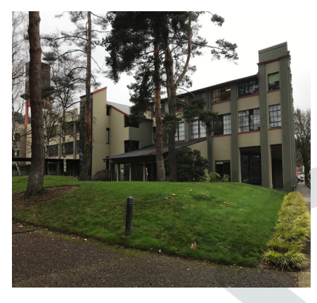
Adaptive reuse of Water Tower building as a commercial business center.

Past City policies envisioned SW Macadam as a tree-lined boulevard with safe routes for both pedestrians and cars. Existing development — a mixture of river-oriented businesses, suburban-style shopping centers, office parks and apartment buildings — does not necessarily support a public realm focused on the comfort and safety of pedestrians over cars. Future site and building design should be responsive to this vision for Macadam Avenue and the context of the Willamette Riverfront.