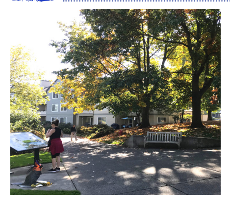
Communal open space along greenway at Heron Point.

The riverfront is significant for the regions' tribal nations, urban native community and others who carry out cultural practices near and on the river, such as launching canoes and fishing. Residents and visitors value the area's nearly two miles of accessible Willamette River shoreline, with an accessible greenway trail, Willamette Park, Heron Pointe Wetlands and the Cottonwood Bay natural area. Development should recognize the recreational, social and cultural values of the riverfront through onsite features and river-responsive design.