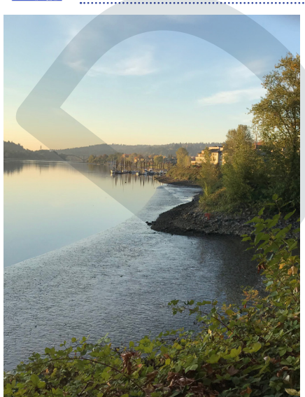
Step back development from greenway to preserve resources and views.

Macadam's location along the Willamette River's South Reach is a key factor in the continued health of local endangered and threatened fish, wildlife and rare plants. This riverine corridor is part of the Pacific Flyway for migrating and nesting birds. Future development along the river and trails should activate the river frontage, while minimizing noise and lighting impacts on the trail and riverfront habitat. Development should include native plantings to enhance wildlife habitat, soften building edges and screen parking areas.