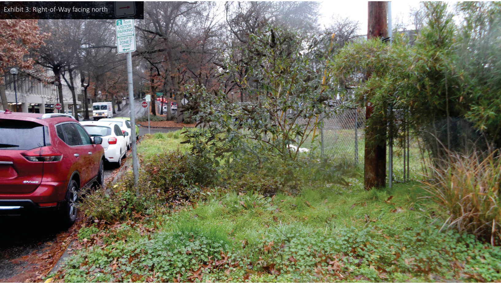
Exhibit 3: Right-of-Way facing north