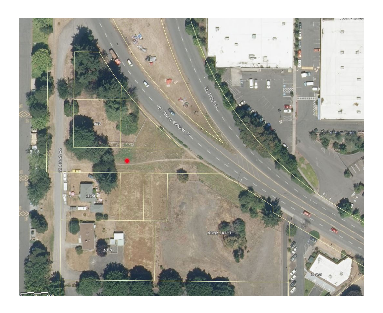
Exhibit C: Aerial Photo