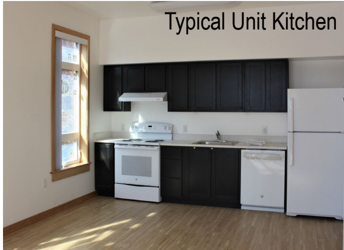
Typical Unit Kitchen