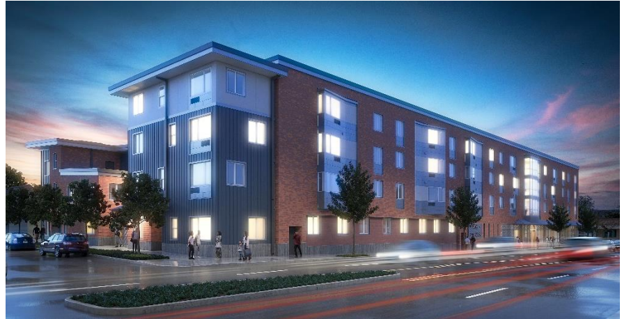
View from NE Highland and MLK Blvd