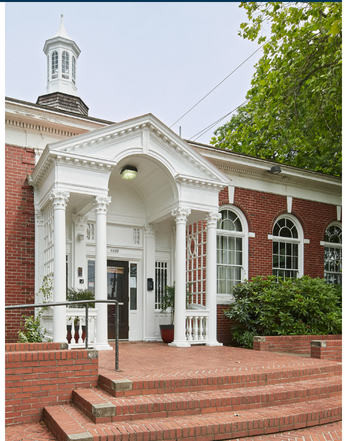
Arleta Branch Library Historic Landmark

If not for State regulations, the proposed zoning code amendments would eliminate owner consent requirements for local historic resource designation and provide only a 120-day demolition delay period for resources listed in the National Register in the future. Should state law change during the 2019 legislative session, the proposed draft of the code proposals will incorporate those changes.