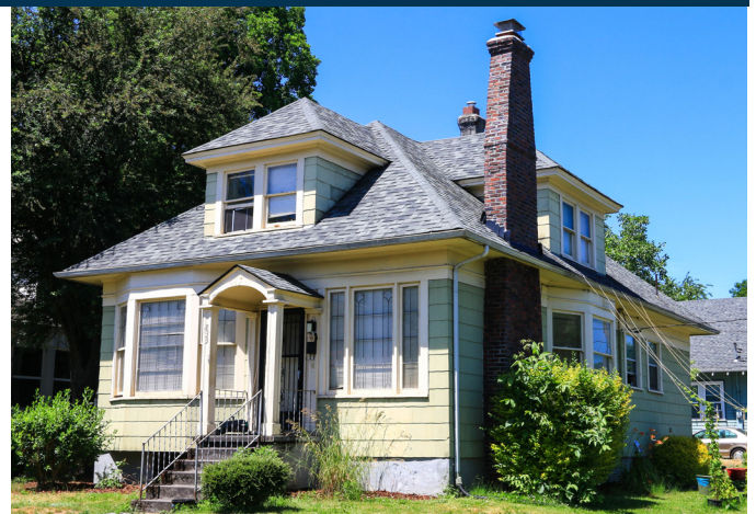
Rutherford House National Register Resource

Since the passage of the 1966 Historic Preservation Act, the National Park Service has provided best practice guidance for documenting, designating, and protecting historic resources. The Park Service maintains the National Register of Historic Places, the nation's official list of buildings, structures, sites, objects, and districts that are significant in American history. For properties listed on the National Register, a federal income tax credit is available for rehabilitation projects. In general, the Park Service does not apply preservation regulations to National Register resources and leaves protection decisions to state and local governments.