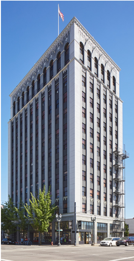
Weatherly Building, a contributing resource in the Grand Ave. Historic District