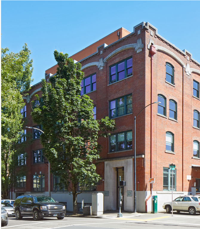
NW 13th Avenue Historic District

This project proposes the most significant changes to Portland's historic resources program in over 20 years. The proposed changes will amend the documentation, designation, and protection framework for Portland's historic resources, while aligning with federal and state rules.