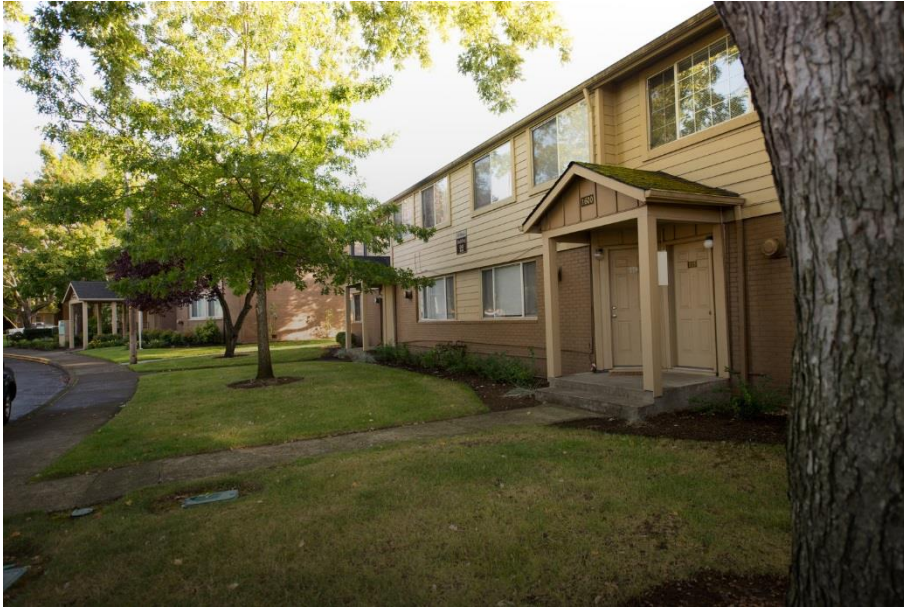
1. Integrated – Ellington Apartments