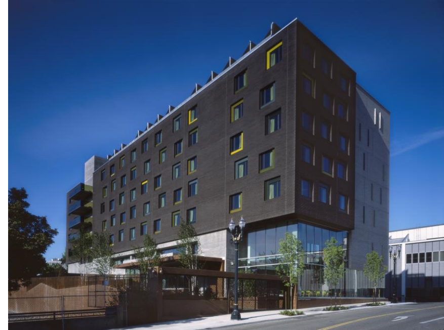
2. Single Site – Bud Clark Commons

3. Scattered Site or Clustered (a.k.a. Leased Units) – JOHS Mobile Permanent Supportive Housing Team as a service model