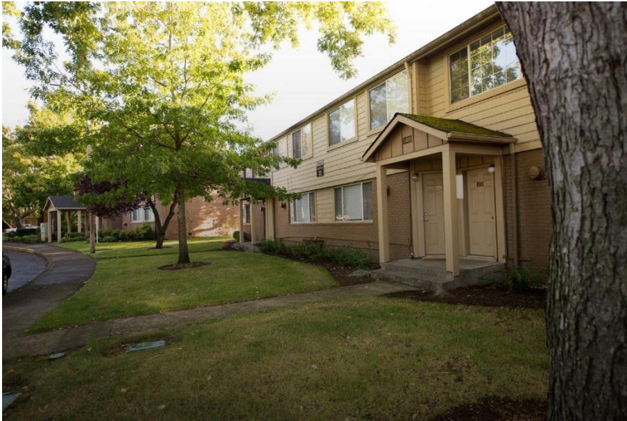
1. Integrated – Ellington Apartments