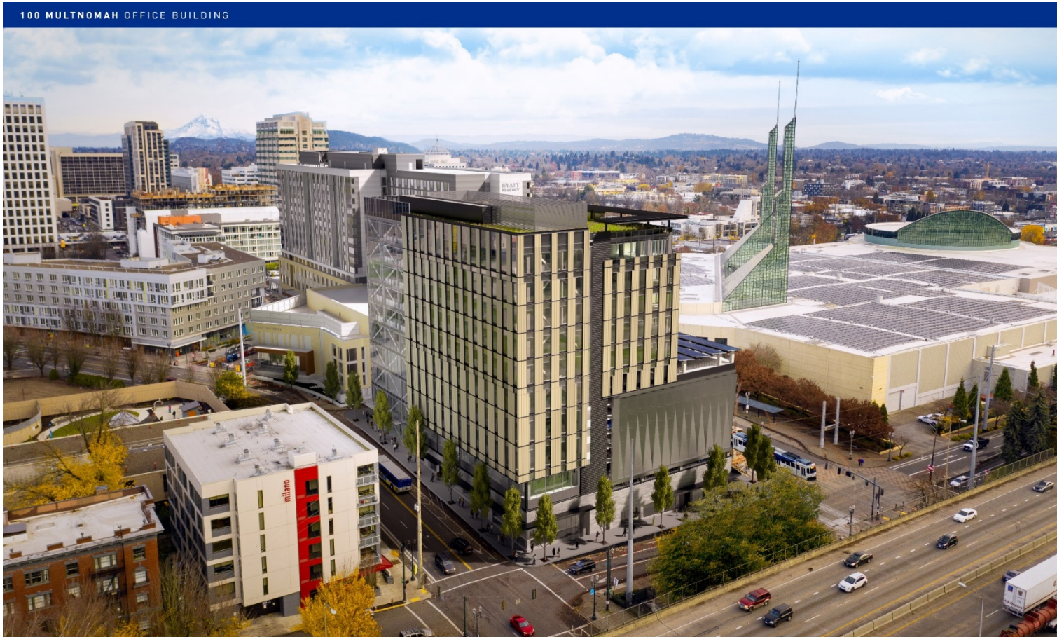
100 MULTNOMAH OFFICE BUILDING