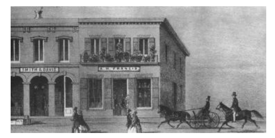
Abner Francis' store, corner of Front and Stark, ca. 1858

Available: https://www.portlandoregon.gov/bps/index.cfm?&c=39764