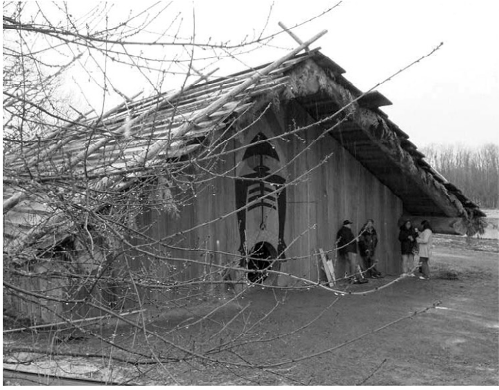
Reconstructed Chinookan Plank House, Ridgefield National Wildlife Refuge, north of Vancouver, WA.

Available: <a href="http://www.portlandonline.com/bps/index.cfm?c=39750">http://www.portlandonline.com/bps/index.cfm?c=39750</a>.