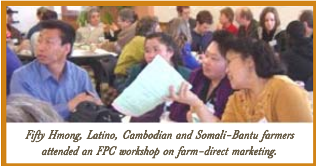
Fifty Hmong, Latino, Cambodian and Somali-Bantu farmers attended an FPC workshop on farm-direct marketing.

Multnomah County Corrections, food service vendor Aramark and local wholesaler Rinella Produce increased purchases of fresh foods from local farmers during a four-month pilot project. More than $30,000 that would have otherwise left the region was redirected to local farms, and the program expanded to an additional seven Oregon counties.