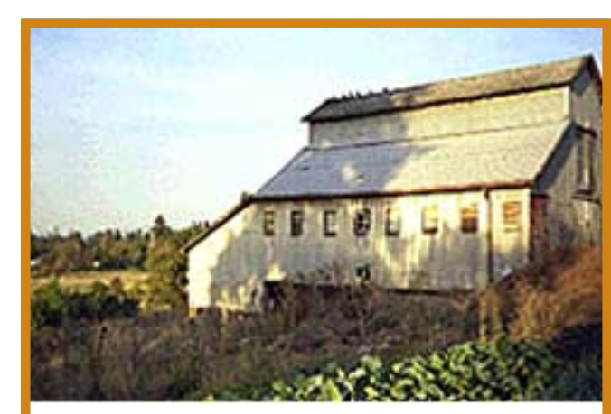
Zenger Farm, located on property owned by the Bureau of Environmental Services, is a cultural and educational asset in Southeast Portland.

energy. The Food Policy Council will work with planners, local governments and businesses on ideas from simple site improvements at existing farmers markets, to the development of new public plazas to house markets and other functions.