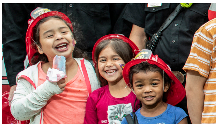
CHILDREN AT THE ELLINGTON ICE CREAM SOCIAL