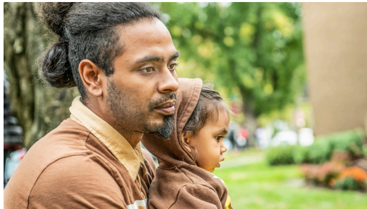
RESIDENTS OF THE ELLINGTON APARTMENTS

The diverse perspectives and expertise of community partners helped inform bond policy development and implementation in the following ways: