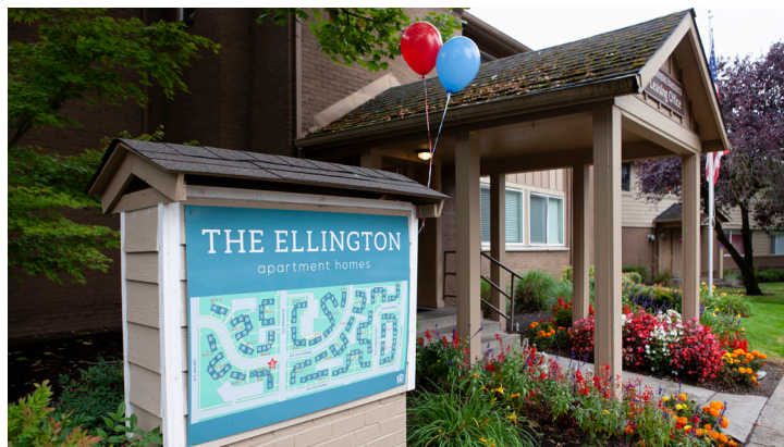
FIRST PROPERTY PURCHASED WITH THE BOND