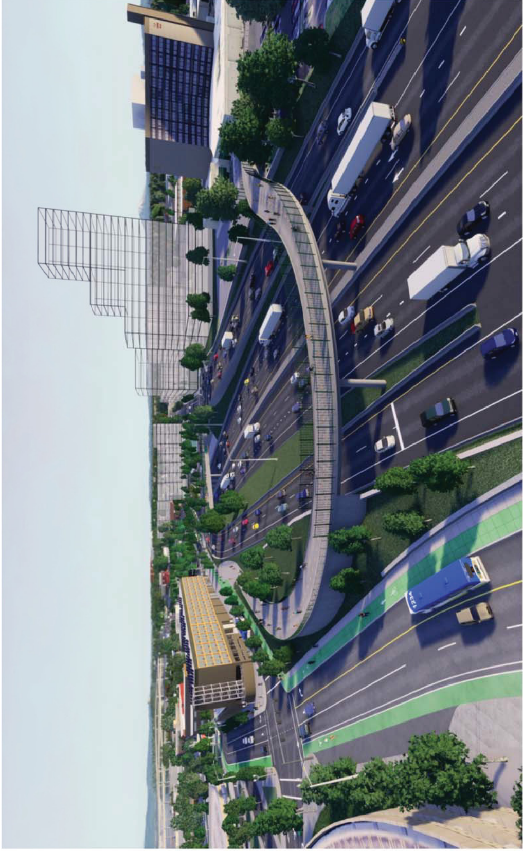
Figure 8. Clackamas Bicycle and Pedestrian Crossing