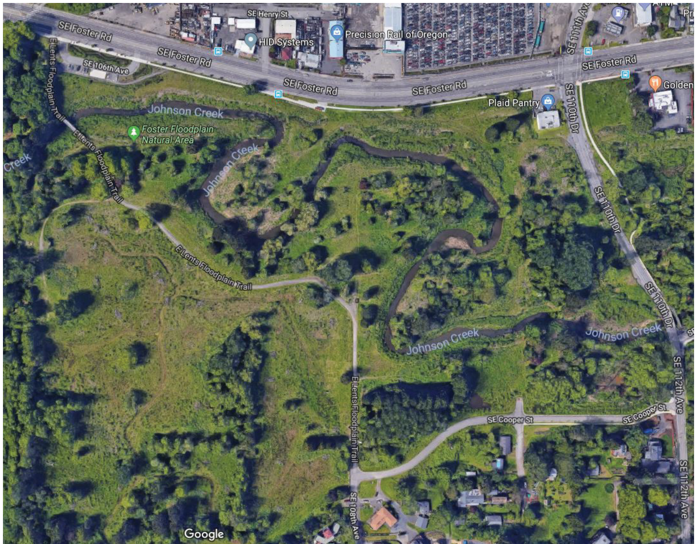
Exhibit 2: Foster Floodplain Aerial