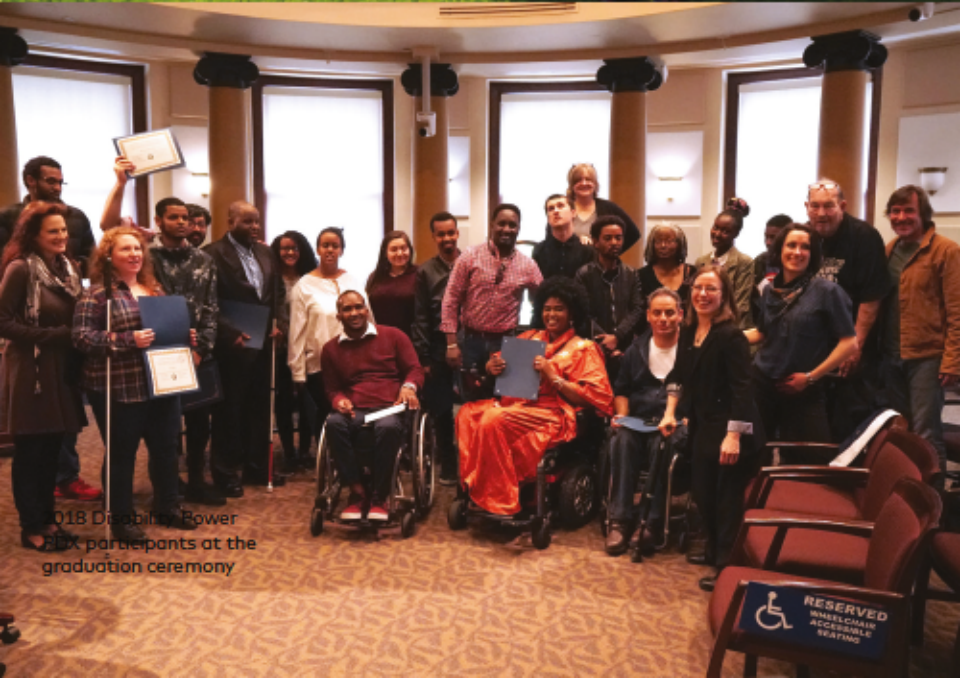
2018 Disability Power Box participants at the graduation ceremony