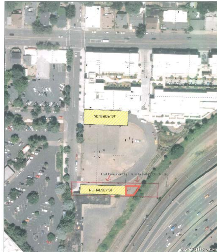
NE Weidler Street and NE Halsey Street east of NE 32nd Avenue

Petitioner: Capstone Partners LLC/City of Portland